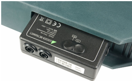
Figure 1: Leakage Current Measuring Adapter at the PROFITEST MXTRA

Before performing measurements, the adapter’s measurement outputs must be plugged into the measurement inputs at the left-hand side of the PROFITEST MXTRA or SECULIFE IP (2-pole current clamp input and probe input).