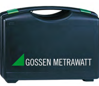
F836 Ever-Ready Case for multimeter and accessories