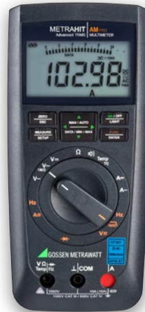
METRAHIT AM PRO