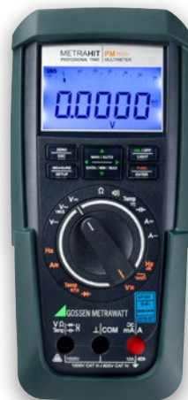
METRAHIT PM TECH