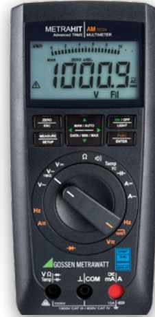
METRAHIT AM TECH