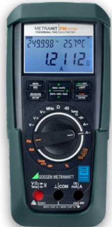
METRAHIT PM PRIME