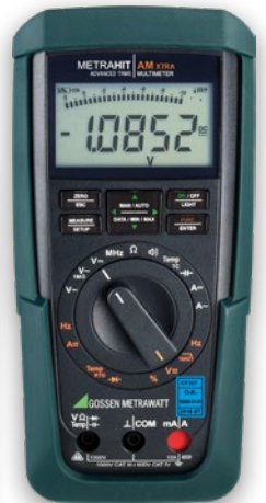
METRAHIT AM XTRA