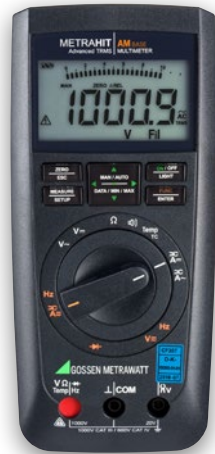
METRAHIT AM BASE

Safe and Reliable Multimeters for Diverse Applications